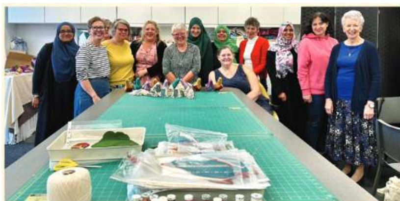
Some of the women who created the Christmas decorations at the Emma Willis Sewing Studio in Gloucester

She also won the Rosa Hui Empowering Women Award at the MTM awards ceremony in Bristol. MTM Awards, launched in 2012 by Mast The Magazine in the South West of England, celebrating business and culture within diverse ethnic communities.