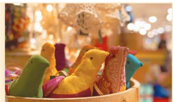
Beautiful birds handcrafted from recycled saris in the Gloucester Services Farmshop

"In my heart I always knew this would be something special. It's given people a sense of belonging. Thank you to Westmorland Family for this incredible opportunity, and to Gloucestershire Gateway Trust for supporting us throughout this process."