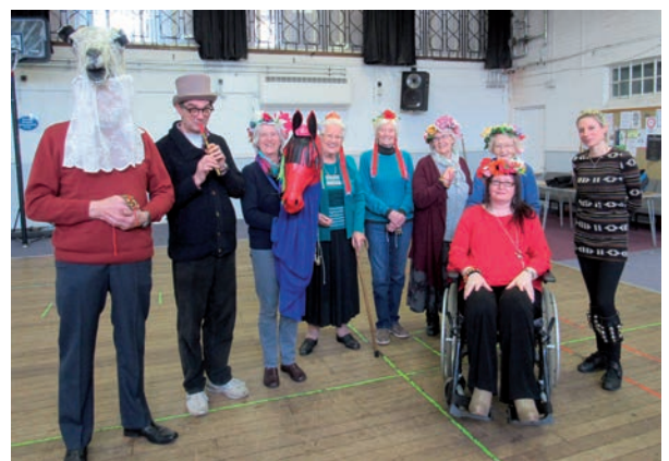
Many adult groups use the Friendship Café throughout the week.

The activities and services also serve as an outlet for many different people to volunteer and get involved in ways that they would not have been able to before or considered. Among the needs that are addressed are reducing social isolation, diversionary and constructive activities for young people, interaction between communities, improving health and exercise levels, acting as a platform and bridge to other agencies and groups for local people and improving aspirations.