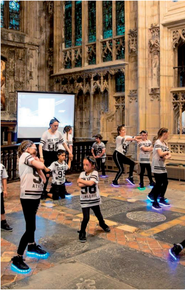
'Street United' performance at the Cathedral. They meet twice weekly at Friendship Cafe