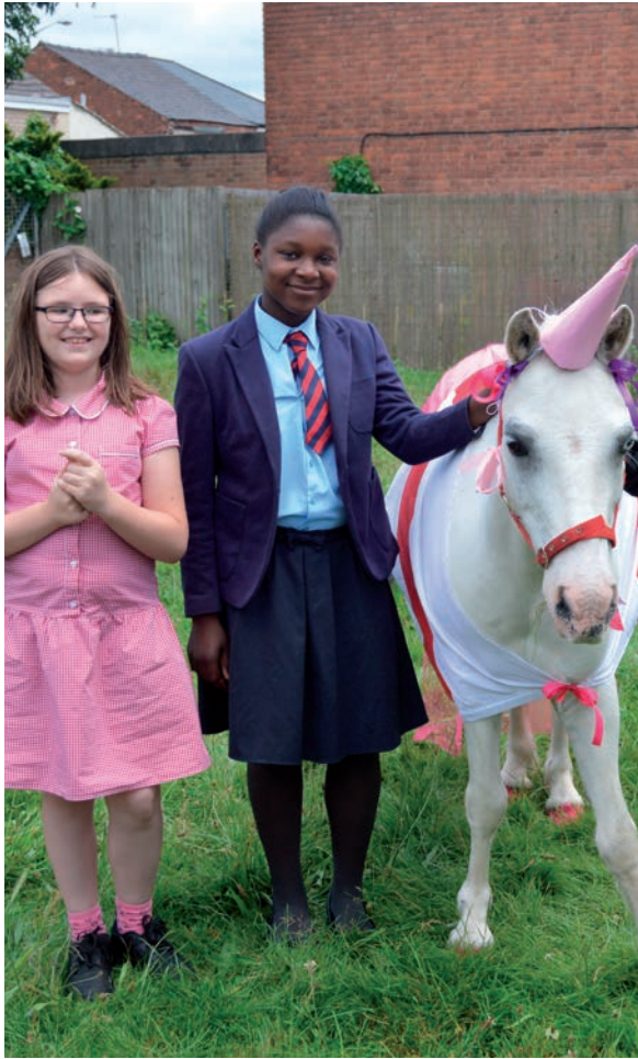
Pony visits to the inner-city schools...

My daughter had been having weekly lessons at your riding school for the last two years. She has now moved on to a bigger riding school in a group lesson.