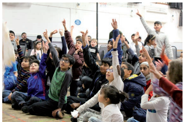
Friday night youth club event...

Winston's Wish – the charity for bereaved children