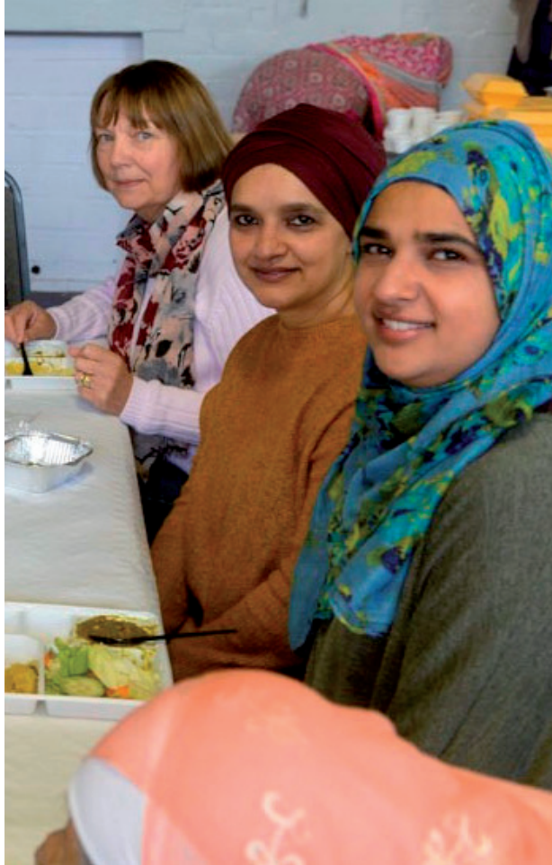
'Burma Refugees Charity Fundraiser Volunteers'