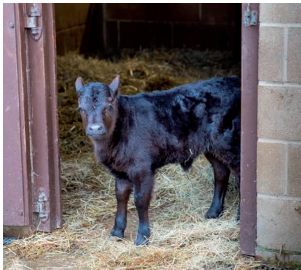
'Treddy' the calf, born at St James City Farm