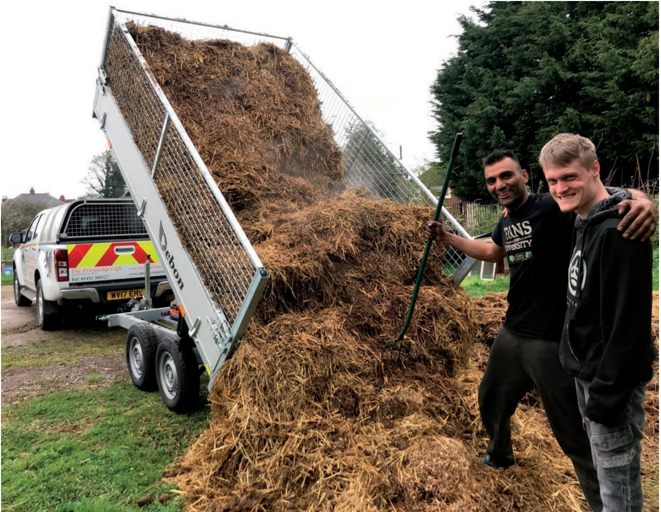
'Tipper trailer', partly sponsored by 'Hands of Friendship' (Freemasons). Makes life a lot easier now...