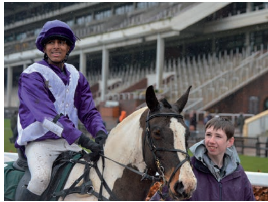
Pony racing at Cheltenham Racecourse...