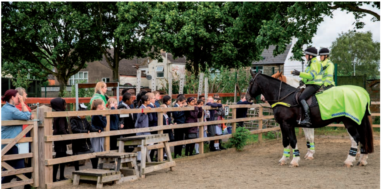
Gloucestershire Constabulary's mounted officers visit the city farm...