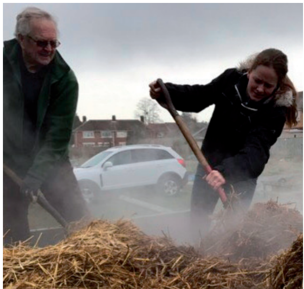
Before the Tipper trailer... It was a hard slog for our volunteers!

Without the constant help and support of the many corporate, public and local sponsors, and most importantly, the volunteers, the achievements of the Friendship Cafe and City Farm would not be possible.