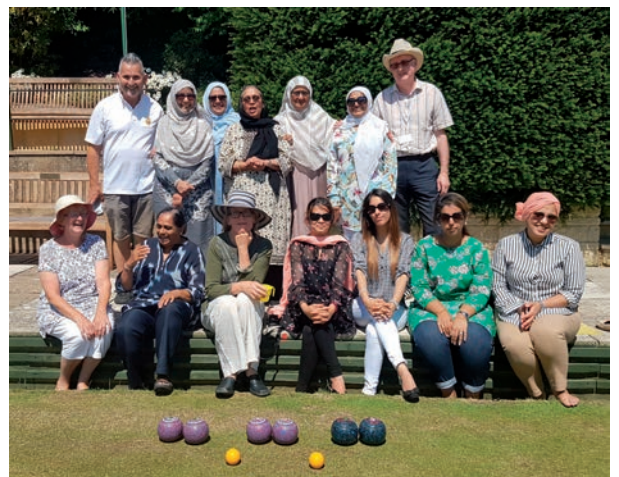
Trip to Painswick Falcon Bowling Club